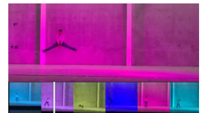
Armaan Smart Steps during New Year's Eve at OAT, IITH